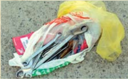
Our rental Hondas came with a full-time mechanic and this high tech bag of tools, which was magically all we needed.

I knew I was in trouble when I met the guys who organize this business; all big smiles and stitches. Partners in an athletics company called Total Body Fitness, they organize a mountain bike race series near my home in Northern California. The moment I signed the