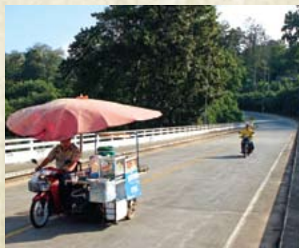
Chitty Chitty Bang Bang, Thai style.

“The energy is especially pleasant for Americans traveling abroad. It's also gorgeous enough to blow your little North American mind.”