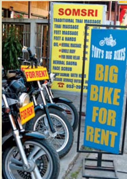
"Big Bike" in Thailand is 400cc and only quasi legal. At Tony's you can get a Thai massage before and after your ride.

I knew I was in trouble when I met the guys who organize this business; all big smiles and stitches. Partners in an athletics company called Total Body Fitness, they organize a mountain bike race series near my home in Northern California. The moment I signed the