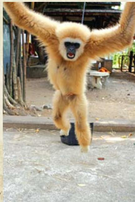
Beware the mean-ass Gibbons. This one was cute as a button until it tried to rip me to shreds.

These long-armed fuzzy things look like extras from The Muppet Movie ; something your kids might curl up with at night. They're apes, and infamous for their cunning. When we stop to enjoy a small, out-of-the-way Buddhist temple, I see one of the furry beasts at the end of a long leash. She can move freely between a few trees and bats her lashes as soon as she sees us. Working me like