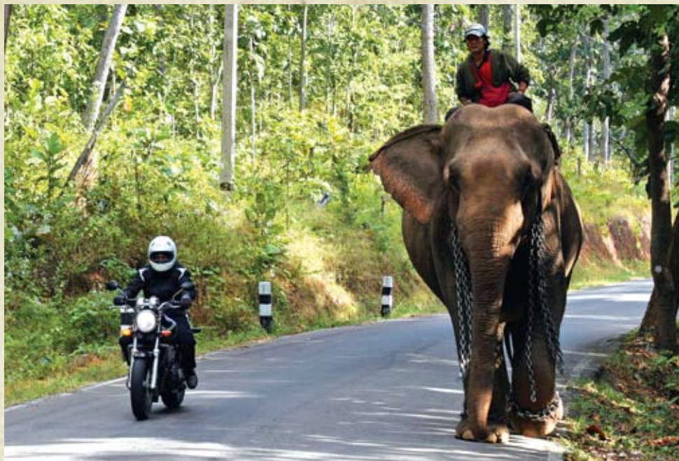
Elephants abound in Thailand, and so do their traffic cone sized poops.

We make no attempt to resist. I'm astonished at the strange and lovely sight of these women and even more astonished to find out how the length of their necks is accomplished. It turns out the necks aren't actually elongated, but after years of adding the thick brass rings (some wear over 20), they've managed to compress their collarbones so much it makes their necks appear stretched. They can't remove the rings because their heads would flop around like Raggedy Ann.