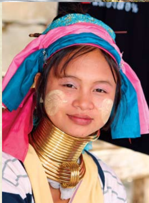
The Long Neck people we encountered were refugees of Burma. Each year the girls add a ring to their odd adornments.

But here I am having the ride of my life, tearing it up like I'm back in high school on roads riddled with empty corners. The pavement isn't exactly smooth, but it doesn't chew you up either. People drive with awareness, but you must keep your head in the game at all times. Thai locals—people and animals—don't expect vehicles, especially the two-wheeled kind, to be carrying much speed. This world is conditioned to the easy ebb and flow of scooter traffic, not fast-moving motorcycles